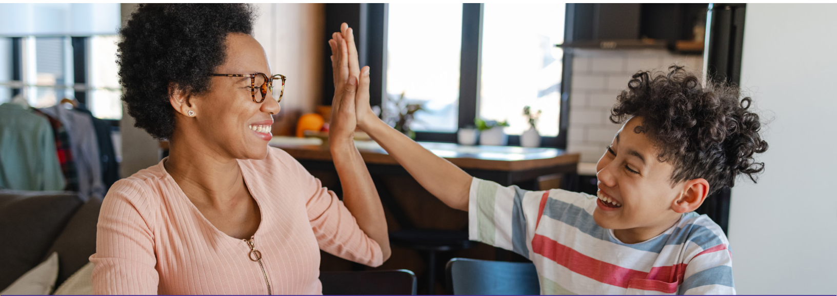
TABLE OF CONTENTS | REFLECTIONS ON RACIAL LEARNING 2023