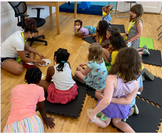
we are Summer Camp

This work is heavy and layered and yet we watch every year as the children in our community tackle the complexities of race and racism and understand that they can use their voices to stand up for themselves and others in the face of injustice. They are not too young! At we are , we believe that Race-based Conversations with Kids Matter! We believe it, we live it out and we see it come to fruition at our camps. The conversations can be messy and they aren't always perfect. But in the end, we are is not striving for perfection but rather the healthy development of racial identities for all children.