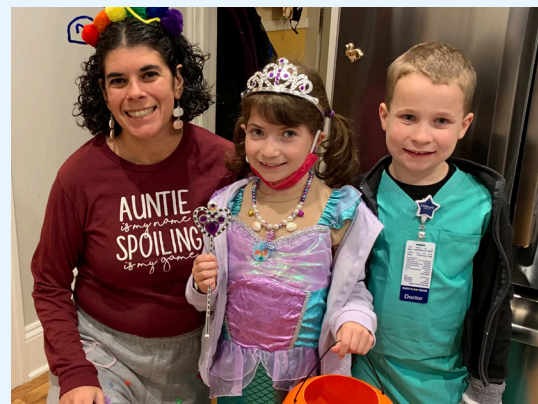
The author as auntie.

These are only beginning steps, and as we move forward in this work, it will be important to continue collaborating across disciplines and between academic and community partners to best serve children and families!